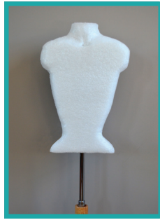
The Cambridge (M2) 18.25" x 18" x 4" $200