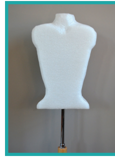
The Hampton (M3) 19" x 19" x 4" $250