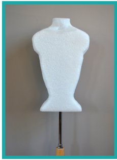
The Andover (M1) 17.75" x 10" x 4" $150

Andover Figures carries four gender-neutral sizes suitable for children's, women's, and smaller men's garments: