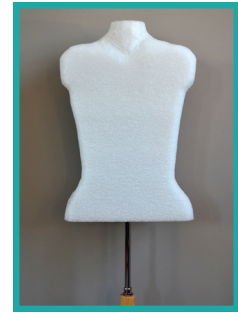
The Shelburne (M4) 20.25" x 20" x 4" $250

Two suspension forms are designed specifically for medium- to large-sized men's garments, as well as unisex items such as shawls, tribal blankets, and capes: