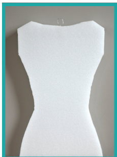
The Newport (S3) 33" x 15" x 2" $150

Four suspension forms are designed for women, but are also appropriate for smaller men's and unisex garments.