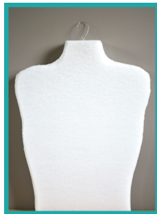
The Exeter (S1) 23" x 18.5" x 2" $150

Two suspension forms are designed specifically for medium- to large-sized men's garments, as well as unisex items such as shawls, tribal blankets, and capes: