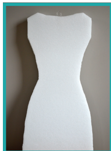
The Dennison (S4) 35" x 16.5" x 2" $200