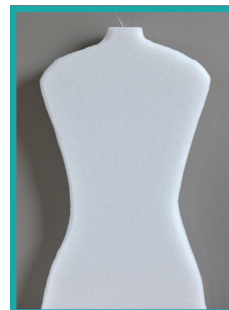
The Kennebunk (S5) 27" x 15" x 2" $150